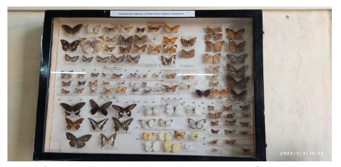
Common Butterflies of New Forest Campus, Dehradun