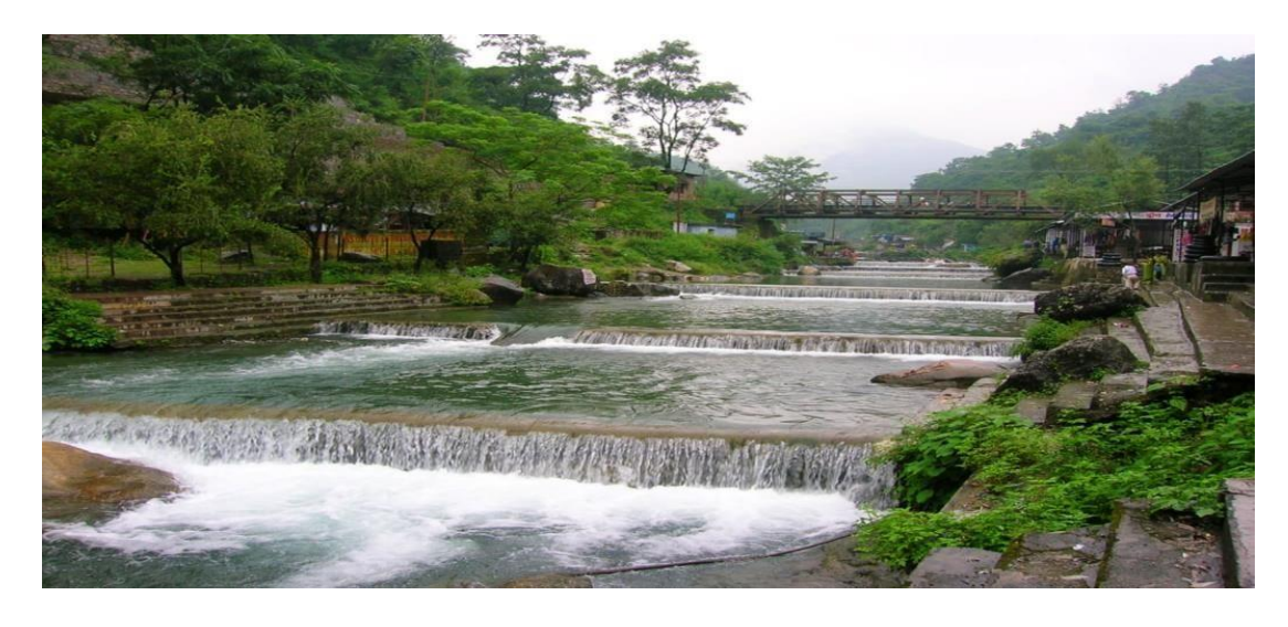
Sulphur Spring at Sahastradhara