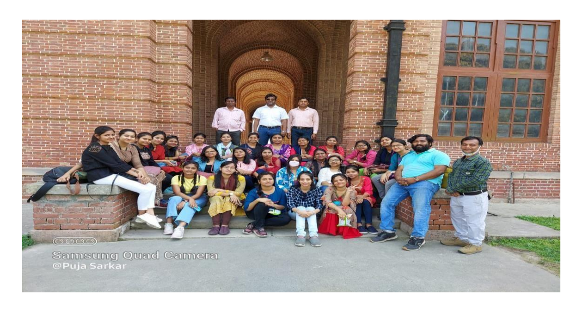
At Forest Research Institute Dehradun