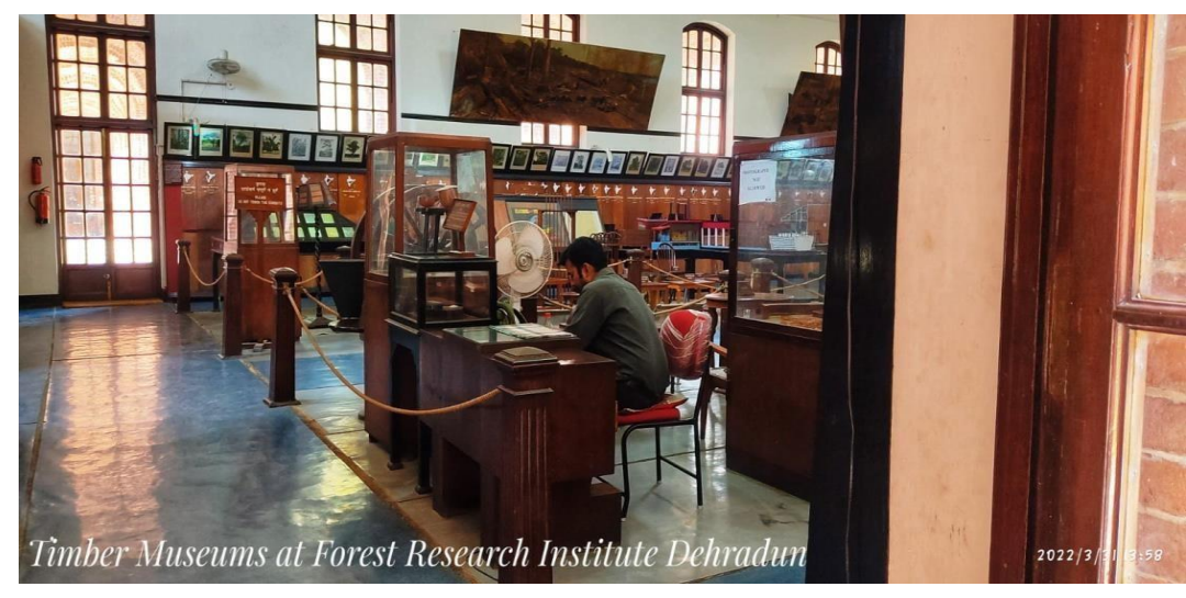
Timber Museums at Forest Research Institute