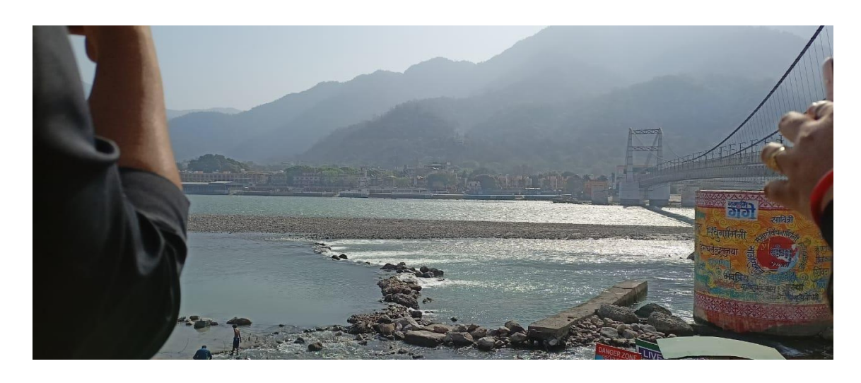
Triveni Ghat, Rishikesh