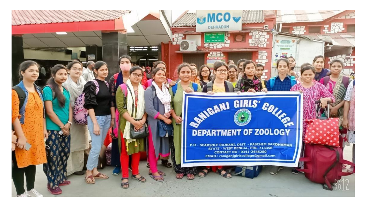
At Dehradun Railway Station