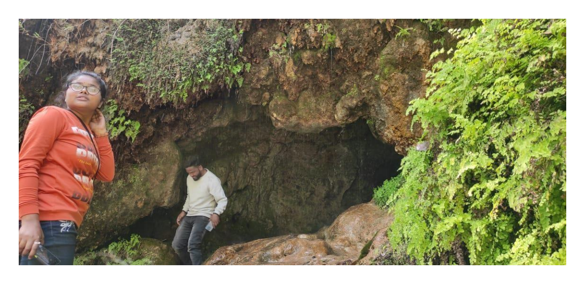
Dron Cave (Sahastradhara)